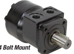
4 Bolt Mount