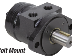
2 Bolt Mount

New Chief Drive Products low speed high torque motors. Interchangeable with many different brands of similar type motors. Pictures are representative of motors. More information including pictures and additional specifications can be found on website.