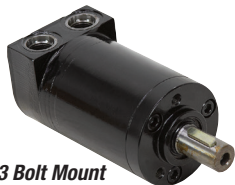
3 Bolt Mount

New Chief Drive Products low speed high torque motors. Interchangeable with many different brands of similar type motors. Pictures are representative of motors. More information including pictures and additional specifications can be found on website.