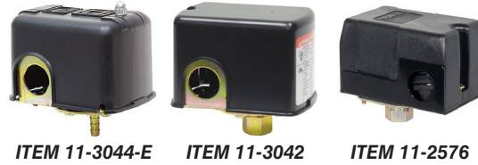
ITEM 11-3044-E ITEM 11-3042 ITEM 11-2576