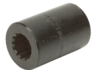
Spline Shaft Couplers