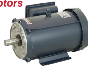
213TC & 215TC Frame