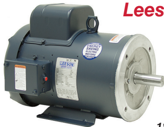
184 TC Frame

• Brand new, LEESON general purpose electric motor. Face mount allows for direct coupling to pumps and gearboxes. Capacitor start and run. Steel housing. Manual reset thermal overload protection.