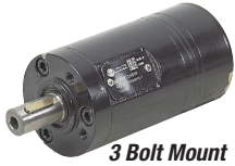
3 Bolt Mount

• New White Drive Products low speed high torque motors. Interchangeable with many different brands of similar type motors. Pictures are representative of motors. More information including pictures and additional specifications can be found on website.