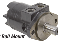
2 Bolt Mount

• New White Drive Products low speed high torque motors. Interchangeable with many different brands of similar type motors. Pictures are representative of motors. More information including pictures and additional specifications can be found on website.