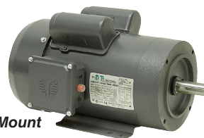
Face & Base Mount

• New, TECHTOP farm duty electric motors. Steel construction. Ball bearings. Capacitor start and run.