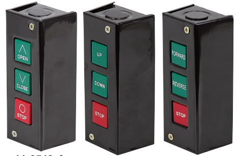
11-3512-A 11-3512-B 11-3512-C