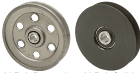
V-Belt Pressed V-Belt Solid

• Use to provide tension on belts. All 3 styles have extended inner race precision ball bearing hubs.