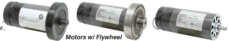
Motors w/ Flywheel

• New, Icon Health and Fitness, permanent magnet motors. Built for use in treadmills, ideal for use with speed controller (sold separately). Would also make an excellent DC generator. Open frame, treadmill duty, reversible rotation.