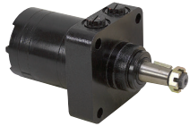
4 Bolt Wheel Mount

• New Danfoss White Drive Products low speed high torque motors. Interchangeable with many different brands of similar type motors. Pictures are representative of motors. More information including pictures and additional specifications can be found on website.