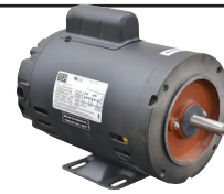
1 HP 3500 RPM Motor ITEM 10-3280 $136.95

• New, WEG electric motor model# MO0C0C0J0000101334 with capacitor-start. Thermal overload protection with automatic reset.