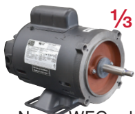
1/3 HP 3470 RPM Motor ITEM 10-3279 $99.95

• New, WEG electric motor model# MO0C0C0J0000100742 capacitor-start. Thermal overload protection with automatic reset.