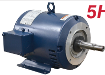
5HP 3505 RPM Motor ITEM 10-3206 $199.95

• New, MARATHON. No thermal overload protection.