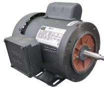
1/2 HP 3470 RPM Motor ITEM 10-3294 $129.95

• New, WEG electric motor model# ME01C0C0J0000100734 capacitor-start. Thermal overload protection with manual reset.