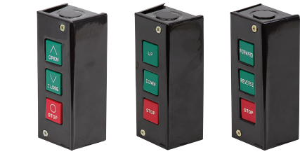
11-3512-A 11-3512-B 11-3512-C